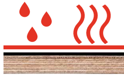
STANDARD COATED PLYWOOD