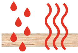
STANDARD UNCOATED PLYWOOD